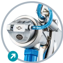
Robust stainless steel air head

Suitable for left and right handed users